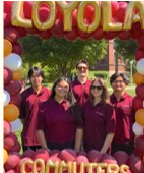
Commuter student Life