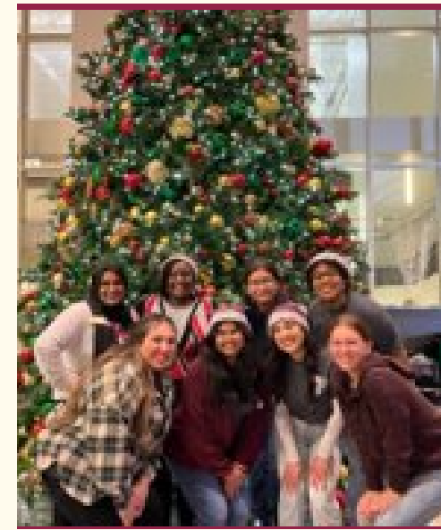
Dept. of Programming