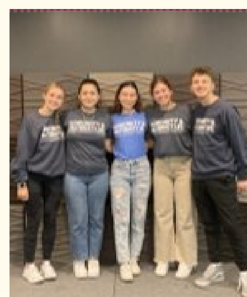
Sorority & Fraternity Life